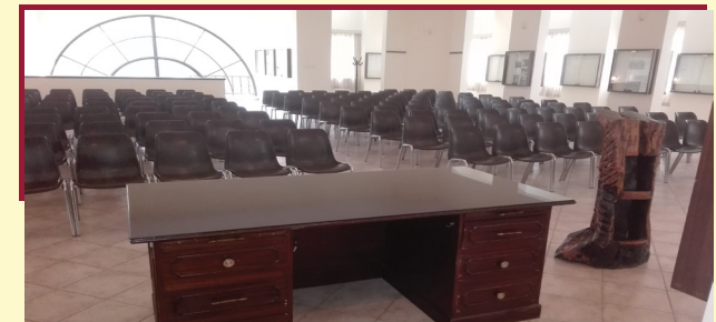
Consolata Conference Hall

Snacks and tea are available in our canteen. Meals can be provided on prior arrangement with the office.