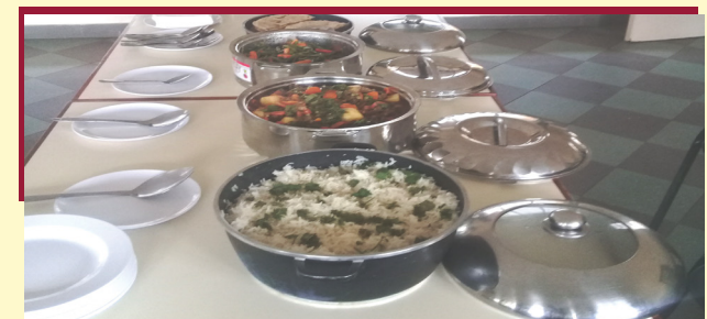
Resurrection Garden Canteen

Snacks and tea are available in our canteen. Meals can be provided on prior arrangement with the office.