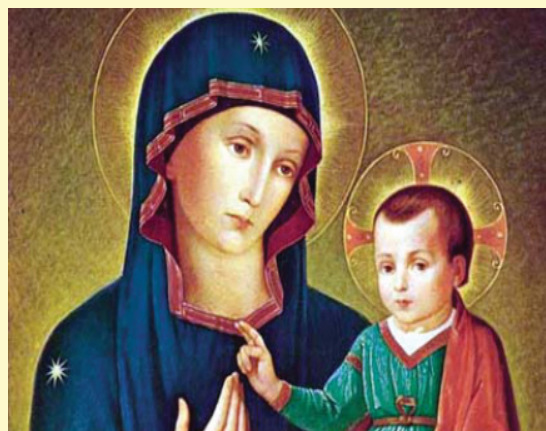
Our Lady Consolata Pray for Us

No fees are charged for the use of the Garden, being a Sacred Place. However, for the maintenance of the Shrine, Groups and individuals are kindly requested to make voluntary donations